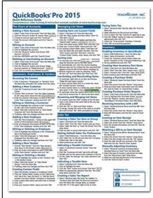
Filesize: 3.9 MB