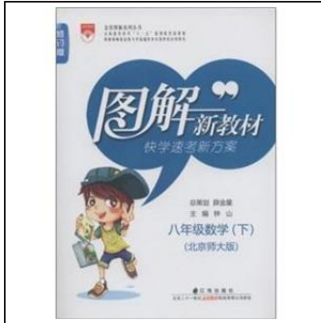
Diagram of the new materials: 8th grade math (Vol.2) (Normal Edition) (Revised)